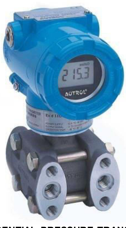
DIFFERENTIAL PRESSURE TRANSMITTER